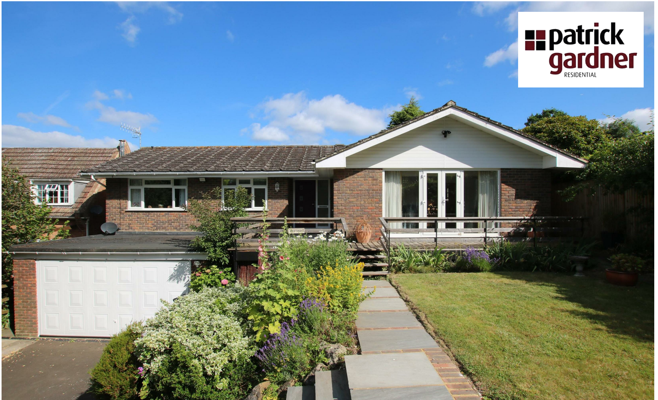
Driftway, Downs Lane, Leatherhead, KT22 8JJ